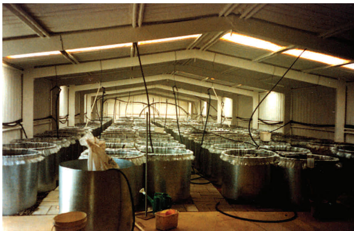
FIG 2.3. Insulated semi-intensive indoor facility under construction, utilizing 150 x 600 litre (158 gal) grow-out tanks. Note sand base, paved walk-ways, and periodic clear roof sheets. (Kilcoy Ornamental Fish, Queensland, Australia.)

The first 7 tanks (G) in the grow-out area are used for holding and conditioning broodstock . The spawning area (B) houses 57 glass tanks of 600 x 300 x 300 mm (24 x 12 x 12 in), in 19 tiers of 3 as shown. These are suitable for spawning a great many species of small to medium-sized egg-scatterers and other batch-spawners. In addition, 6 tanks of 900 x 300 x 300 mm (36 x 12 x 12 in) are suitable for spawning large barbs,